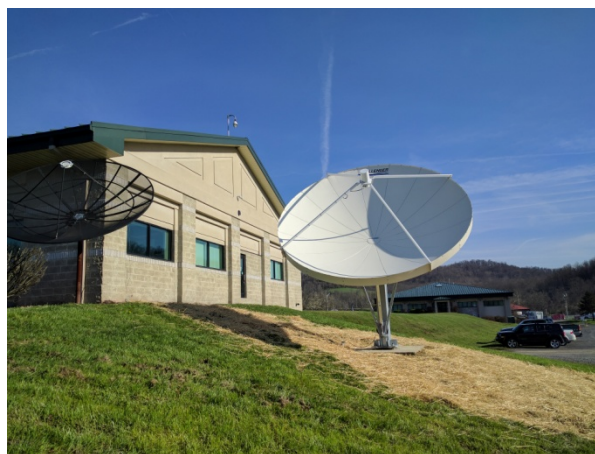
4.5 meter dish for GRB ground system